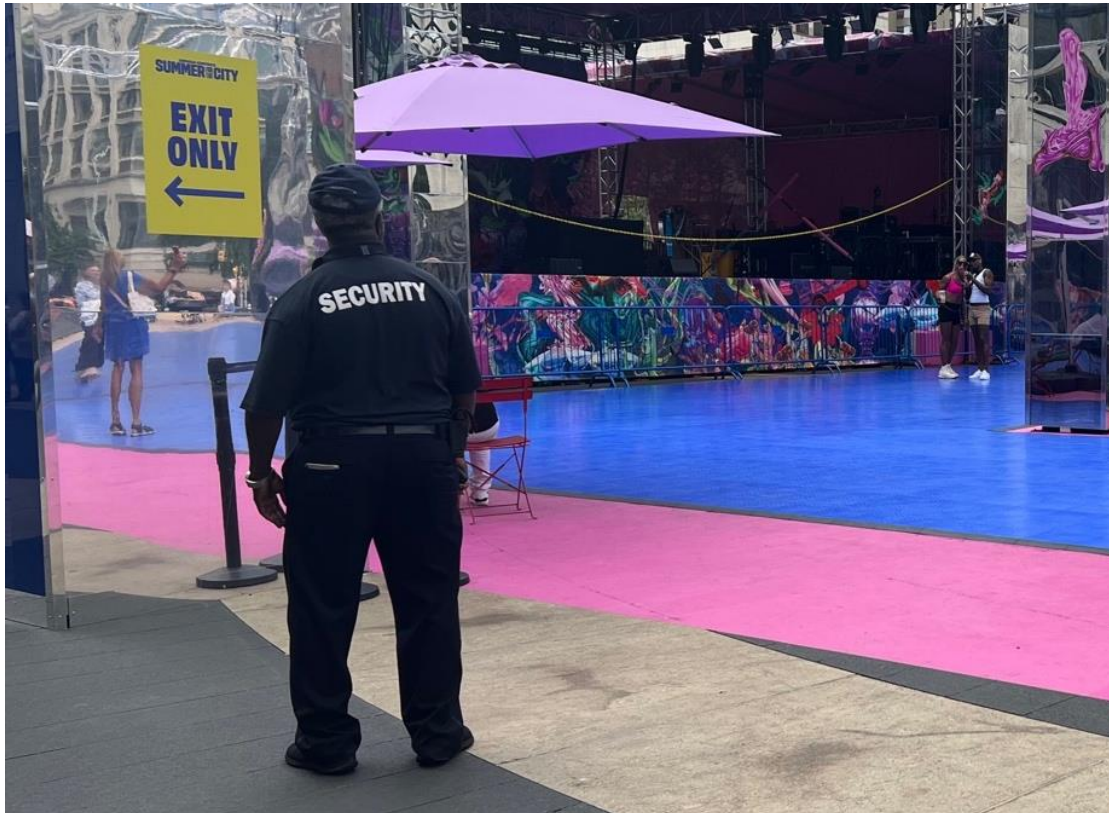
A Lincoln Center security guard standing at the exit to The Dance Floor wearing black pants, a navy blue baseball cap, and a navy blue shirt with the word SECURITY written on the back in white letters and a "Lincoln Center Security" logo on the front.

Lincoln Center Security will be monitoring this event. There may also be unexpected NYPD presence, as the plaza is a public space.