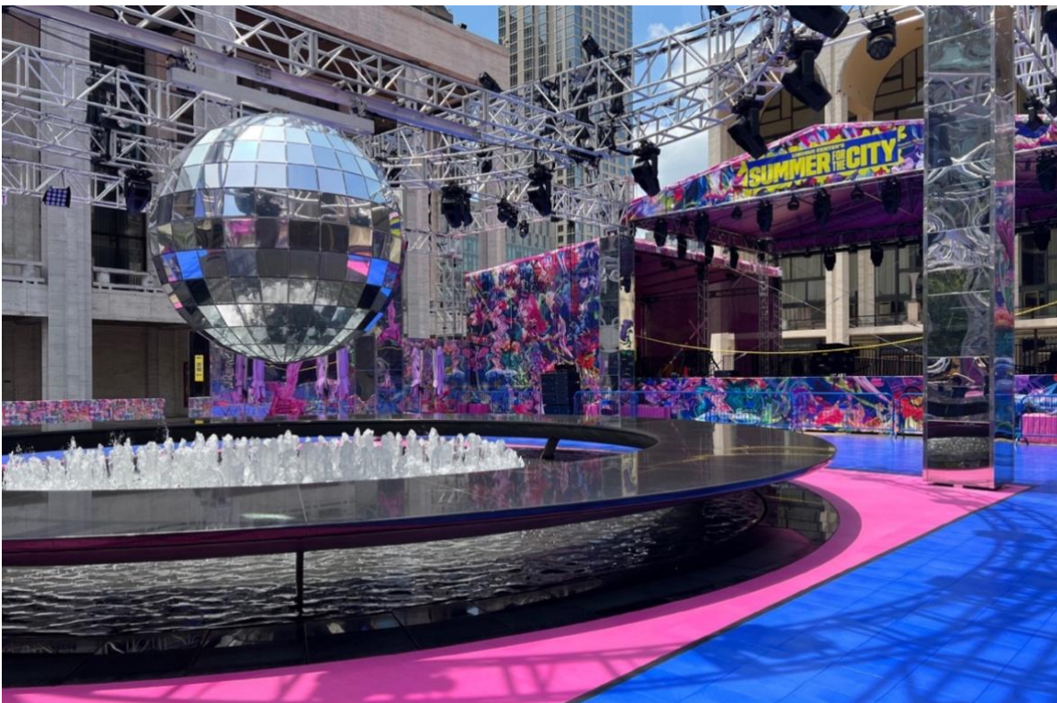
A 10-foot disco ball hangs above the circular fountain in Josie Robertson Plaza supported by reflective metal scaffolding. The plastic tile flooring is bright blue, with bright pink tiles forming a square in the center of the venue surrounding the fountain. In the background is a large stage surrounded by vinyl covered with an indistinguishable abstract multi-colored pattern. On the center of the stage roof is LINCOLN CENTER'S SUMMER FOR THE CITY in bold yellow print on a blue background.

The Dance Floor is open to the public during daytime non-event hours.