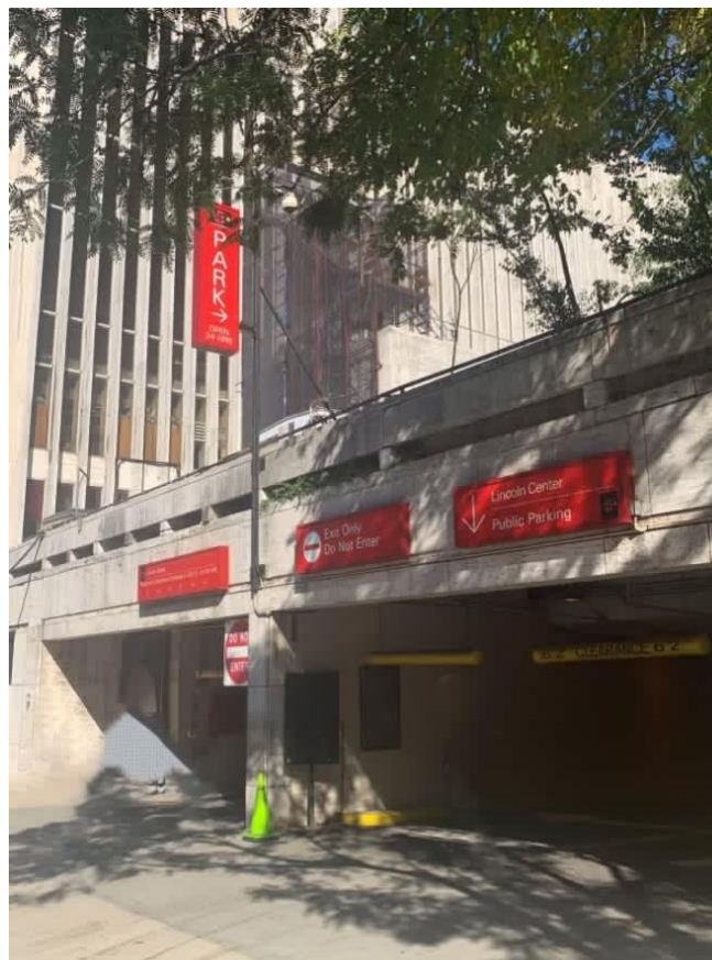
The entrance to the Lincoln Center Parking garage: a concrete structure with red signage denoting entrances and exits. Above the garage, a red sign reads PARK with an arrow towards the entrance. There are trees in the background and a tall concrete building. In front of the garage are yellow clearance bars and a neon green traffic cone.

To reserve parking, call CenterCharge at 212-721-6500 or visit online at Tickets.LincolnCenter.org/parking .