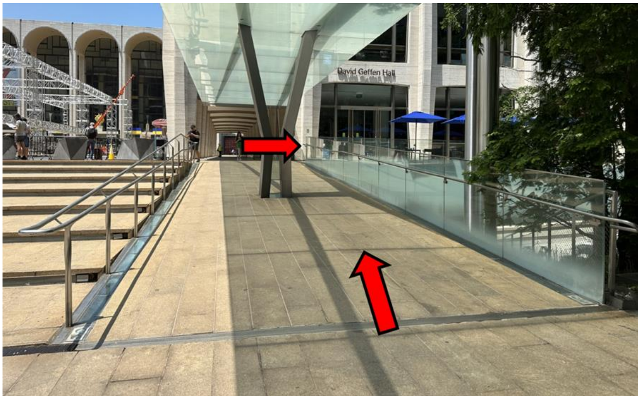
Ramp towards David Geffen Hall with two red arrows; one pointing up the ramp from Columbus Avenue, the other pointing right at the top of the ramp to the entrance to the Welcome Center. The ramp has a blue-tinted glass roof and metal railings on either side. To the left of the ramp are stairs.

The Welcome Center is accessible via stairs or ramp at 64th and Columbus.