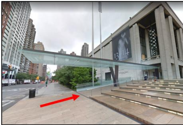
View from the Columbus Ave in front of the David Koch building. A red arrow points to ramp entrance beneath a long glass overhang. To the right are stairs with illuminated text running across them.

The Fast Track and General Admission lines to enter The Dance Floor begin next to the David H. Koch Theatre on 63 rd Street and Columbus Avenue. Both lines can be accessed via steps that stretch between 63 rd and 64 th street or a ramp located to the left of the stairs near the Koch Theatre.