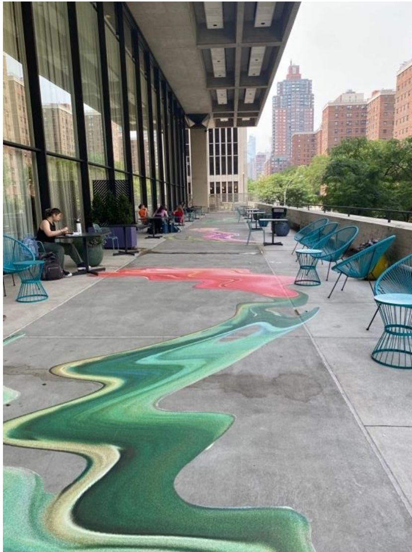
A long balcony with an assortment of tables and blue wire chairs lining both sides. On the left a long wall of glass windows with black frames, on the right a row of green treetops.

The New York Public Library for the Performing Arts has opened an Outdoor Reading Room and seating area . This space is located on the corner of Amsterdam Avenue and 65 th Street and can be accessed directly from Hearst Plaza. Visit the library's website to learn more .