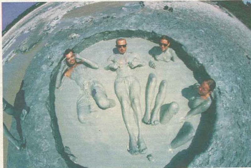
Where a wallow makes the summer Give your skin a treat in the mudpools at Espalmador on Formentera (No 45)