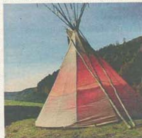
Go west Well as far west as Wales if you fancy a stay in a teepee (No 46)

The Doctor's Bothy is a newly renovated cottage on the Hebridean island of North Uist. The cottage is on a hillside above Loch Hosta and has dramatic views over