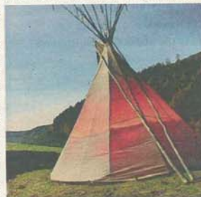
Go west Well as far west as Wales if you fancy a stay in a teepee (No 46)

The Doctor's Bothy is a newly renovated cottage on the Hebridean island of North Uist. The cottage is on a hillside above Loch Hosta and has dramatic views over