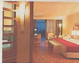
Lap of luxury: (clockwise from main) one of the pools at Lefay Resort; a bedroom at the hotel; lakeside elegance; Lake Garda at sunset APPYGETTY