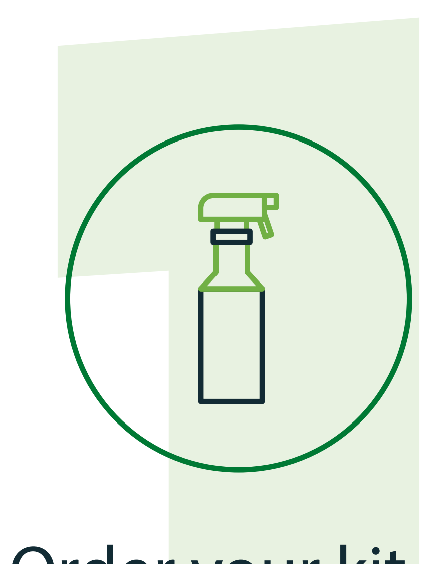
Order your kit. We give you ALL the tools you'll need