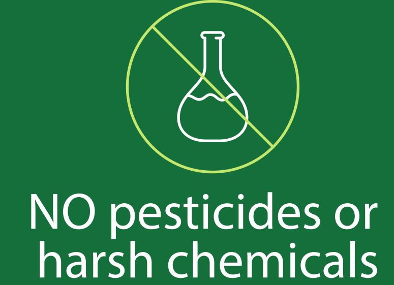
Safe for ALL ages, including infants and pregnant women