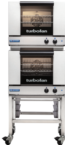
Model E22M3/2C shown

Double Stacked on a Stainless Steel Base Stand