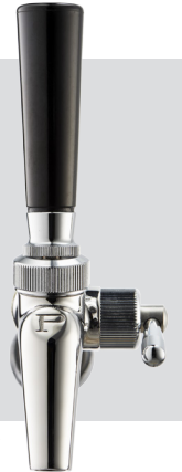
650SS Flow Control

P erlick's Forward Sealing Beer Faucets are unique in both appearance and function. The revolutionary ball and floating O-ring design eliminates the need for a valve shaft. Beer is not exposed to air so the handle lever doesn't stick, and there is no build up of mold and bacteria in the faucet body. The polished interior produces a smooth flow with less foaming, ensuring a perfect pour each and every time. Fewer internal parts means better reliability and fewer service calls. This faucet will fit all standard North American shanks.