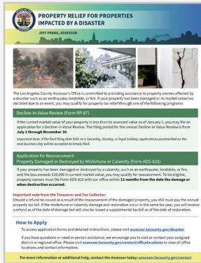
Disaster Relief Factsheet