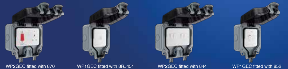
WP2GEC fitted with 870