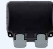
WP22RCD closed lid