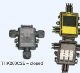
THK200C2E – closed