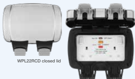
WPL22RCD closed lid WPL22RCD