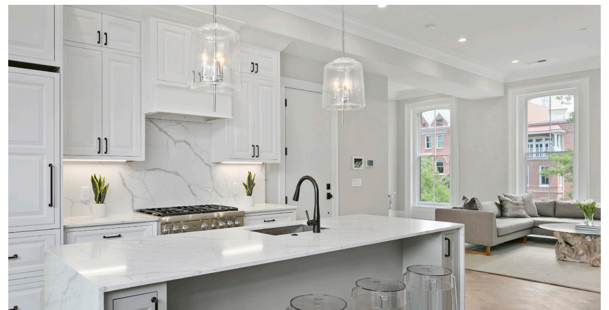
Unit 4 2 Bedrooms 2 Bathrooms 1,695 SF