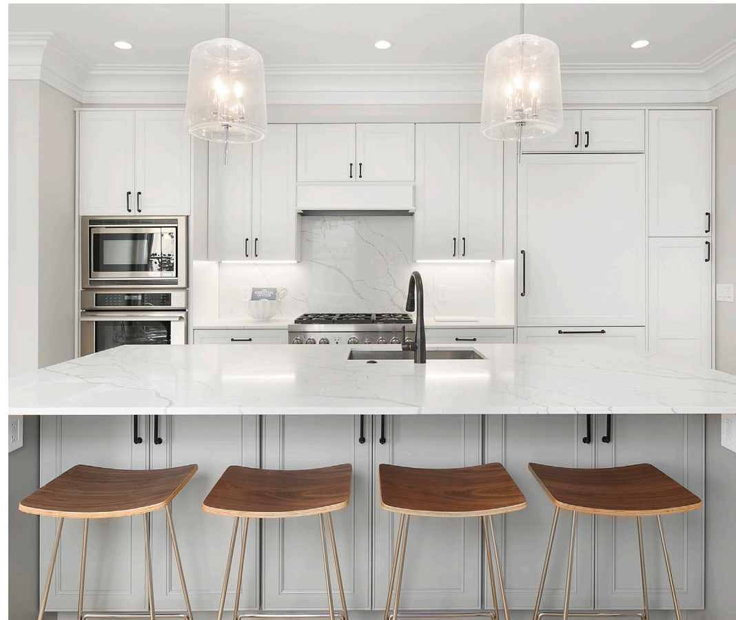
Unit 5 | Penthouse 3 Bedrooms 3 Bathrooms 2,860 SF