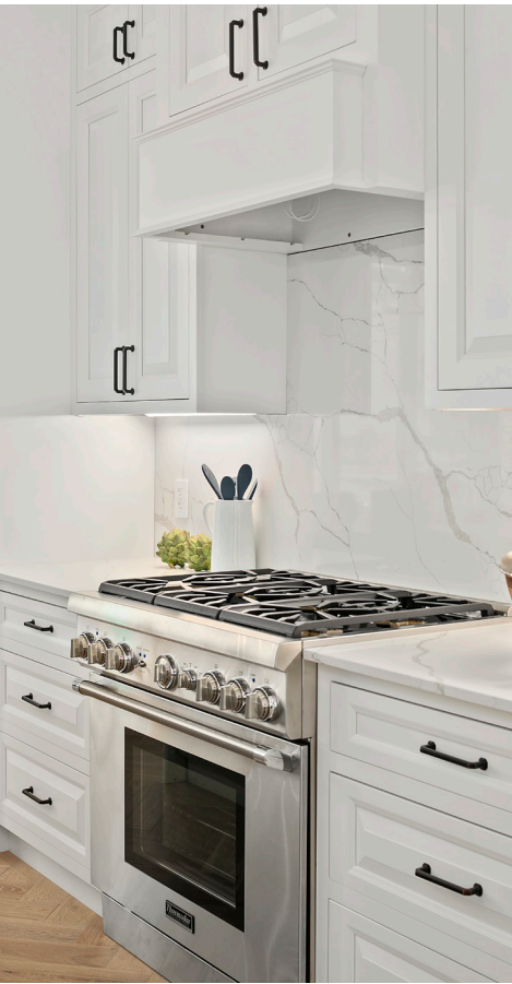
Unit 1 1 Bedroom 1 Bathroom 620 SF