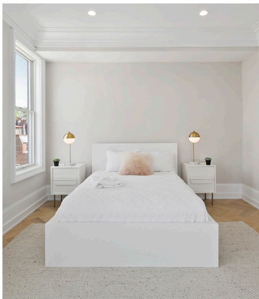
Unit 6 1 Bedroom 1 Bathroom 895 SF