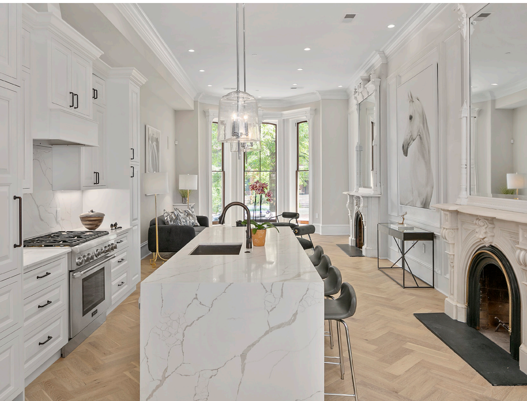
Unit 3 2 Bedrooms 2 Bathrooms 1,600 SF