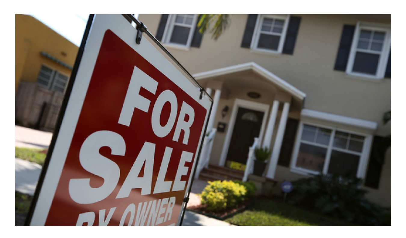
Image copyright 2017 Getty Images. All rights reserved. This material may not be published, broadcast, rewritten, or redistributed.