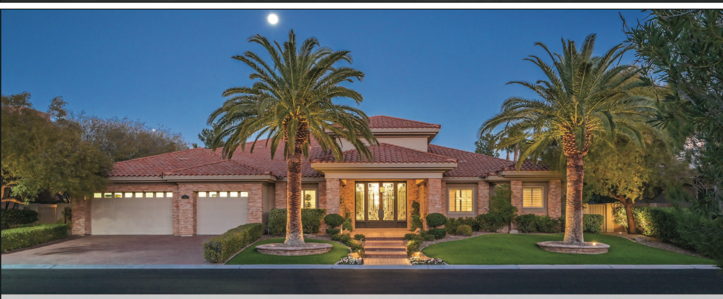
5098 Mountain Top Circle - Smart Sophistication at it's Finest! - Offered at $2,450,000.00, 6,552 sq ft, 5 bedrooms, 6 baths.