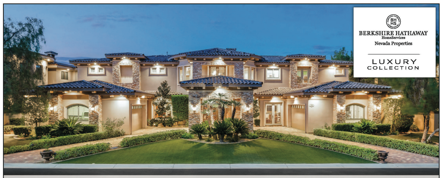
5156 Scenic Ridge Drive - A Majestic Masterpiece - Offered at $4,700,000.00, 10,633 sq ft, 8 bedrooms, 10 baths.