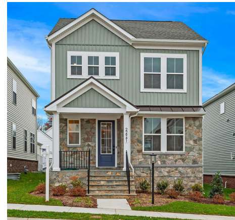
ASHBURN, VA $1,043,511 41987 Spring Air Dr