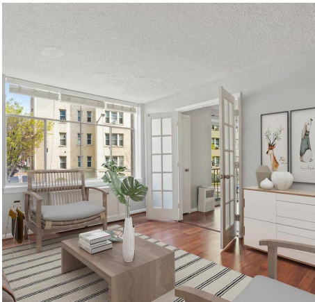
WASHINGTON, DC $496,000 1239 Vermont Ave NW #205