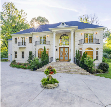
FALLS CHURCH, VA $2,050,000 6463 Eppard St