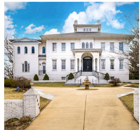
OAKTON, VA $2,300,000 2909 Chain Bridge Rd