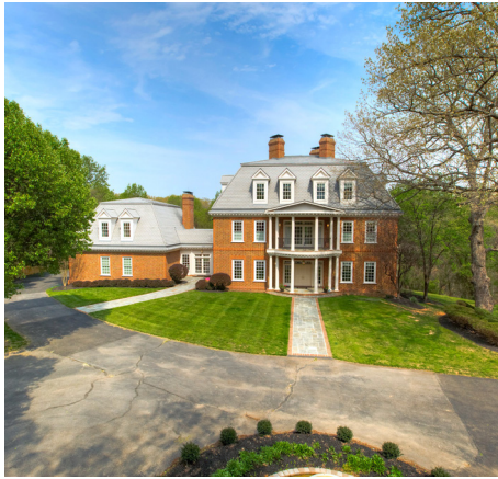
GREAT FALLS, VA $3,180,000 11206 Richland Grove Dr