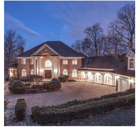
MCLEAN, VA $4,600,000 703 Potomac Knolls Dr