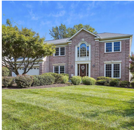
HERNDON, VA $800,000 12109 Heather Way