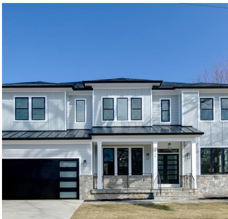
MCLEAN, VA $2,480,000 6810 Old Chesterbrook Rd