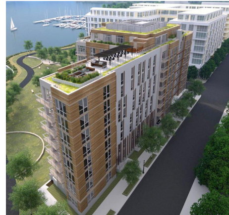
WASHINGTON, DC $782,000 88 V St SW #303