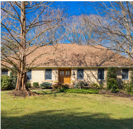
VIENNA, VA $1,160,000 1687 Abbey Oak Dr