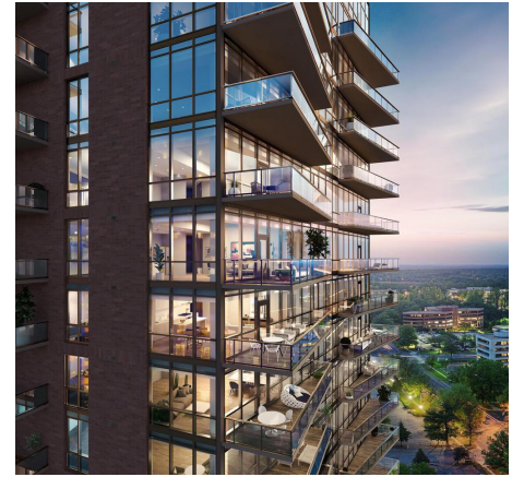
MCLEAN, VA $2,497,750 7887 Jones Branch Dr #1603