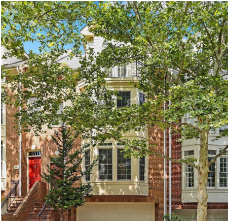
ARLINGTON, VA $1,300,000 1542 N Colonial Ter