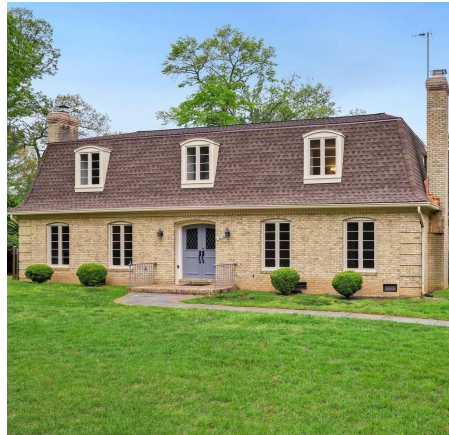
GREAT FALLS, VA $1,295,000 10112 Sanders Ct