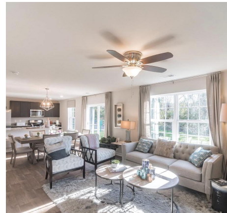
LOCUST GROVE, VA $427,490 35460 Quail Meadow Ln