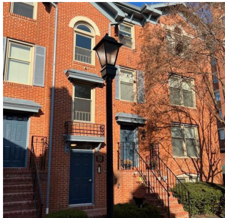
ALEXANDRIA, VA $495,000 557 Colecroft Ct #5-7