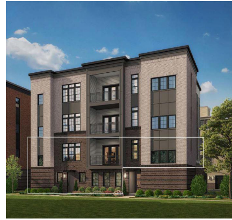
ASHBURN, VA $912,995 Moore Field Metro Station #1901