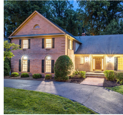
MCLEAN, VA $1,675,000 7700 Crossover Dr