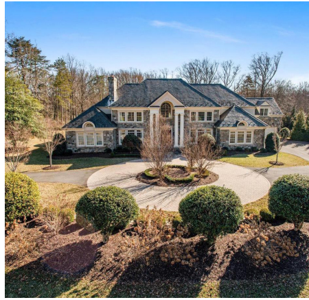
MCLEAN, VA $5,300,000 8407 Parham