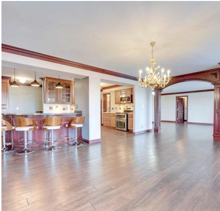
MCLEAN, VA $890,000 8380 Greensboro #1004