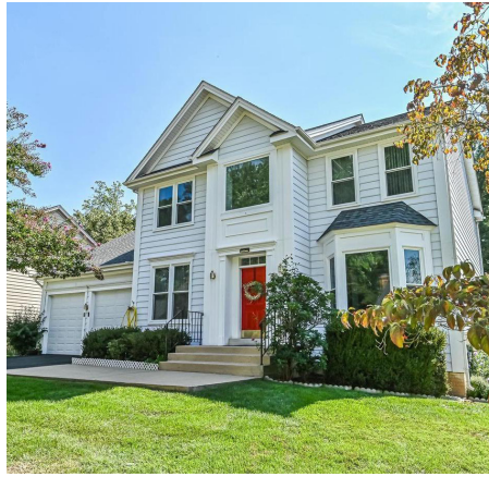
BURKE, VA $950,000 9021 Advantage Ct