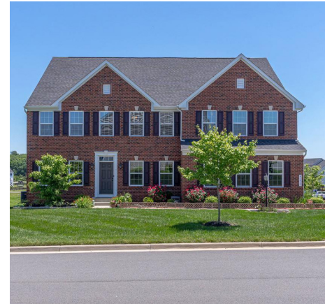
CHANTILLY, VA $1,210,000 42622 Gold Thread Dr