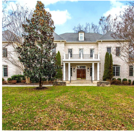
MCLEAN, VA $2,800,000 1023 Eaton Dr