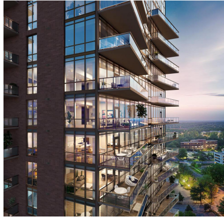
MCLEAN, VA $1,739,210 7887 Jones Branch Dr #704