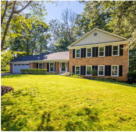
POTOMAC, VA $1,000,000 38 Trailridge Ct