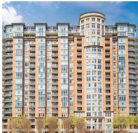
MCLEAN, VA $1,050,000 8220 Crestwood Heights #904