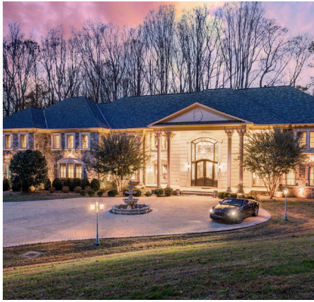
MCLEAN, VA $5,330,000 904 Chinquapin Rd