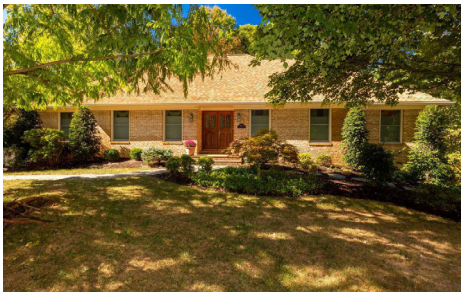
VIENNA, VA $916,687 1687 ABBEY OAK DR