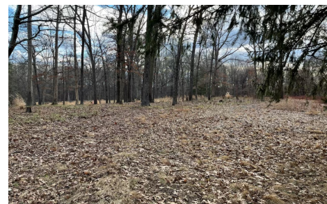
POTOMAC, MD $590,000 12212 McCROSSIN LN