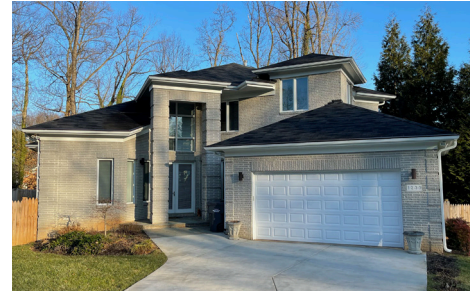
McLEAN, VA $1,250,000 1239 PROVIDENCE TER