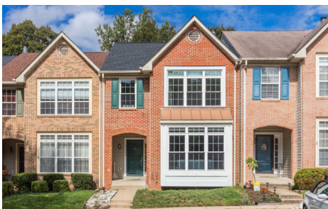
WOODBIDGE, VA $420,000 11456 CORINTHIA CT