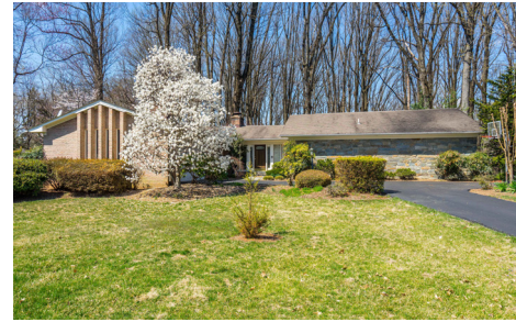
McLEAN, VA $1,100,000 1160 OLD STAGE CT