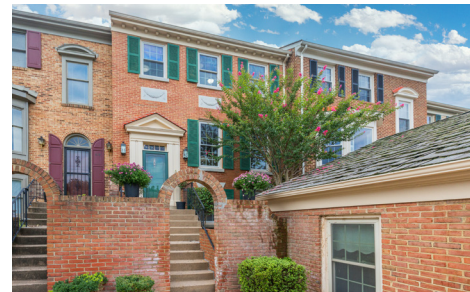
VIENNA, VA $725,000 514 COUNCIL CT