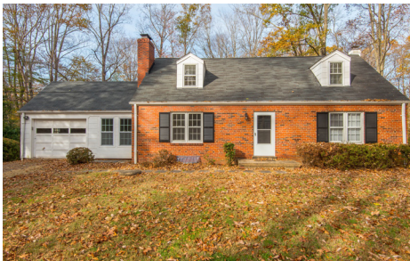
McLEAN, VA $1,060,000 910 CHINQUAPIN RD