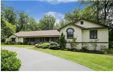
McLEAN, VA $1,500,000 8605 BROOK RD