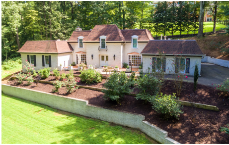
McLEAN, VA $1,225,000 8751 BROOK RD