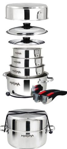
"Nests" in less than 1/2 cubic foot

See Our Website for Other Quality Magma Accessories