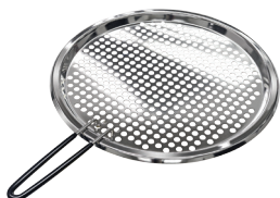
Fish & Veggie Grill Tray Stainless Steel Finish