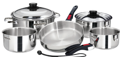
Stainless Steel Finish