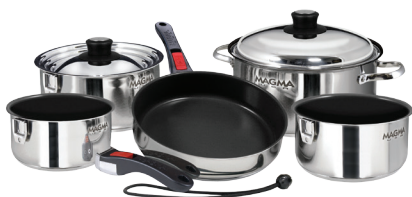
Stainless Steel with Ceramica® Non-Stick