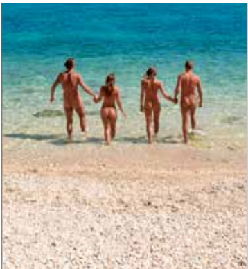
NATURIST PARK KOVERSADA

DISCOVER WHY VRSAR IS AN INEXHAUSTIBLE SOURCE OF INSPIRATION FOR ADVENTURERS, ARTISTS AND LOVERS.