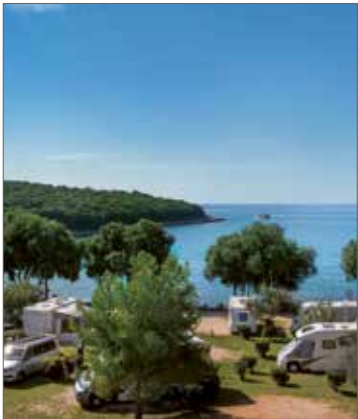
CAMPSITE PORTO SOLE