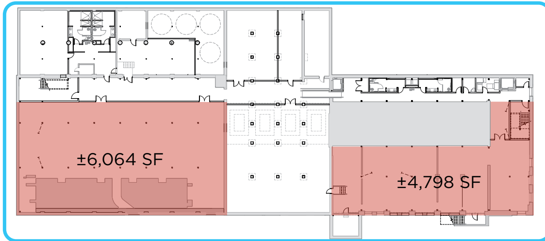
LOWER LEVEL FLOOR PLAN - 10,862 SF