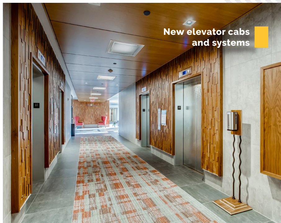
New elevator cabs and systems