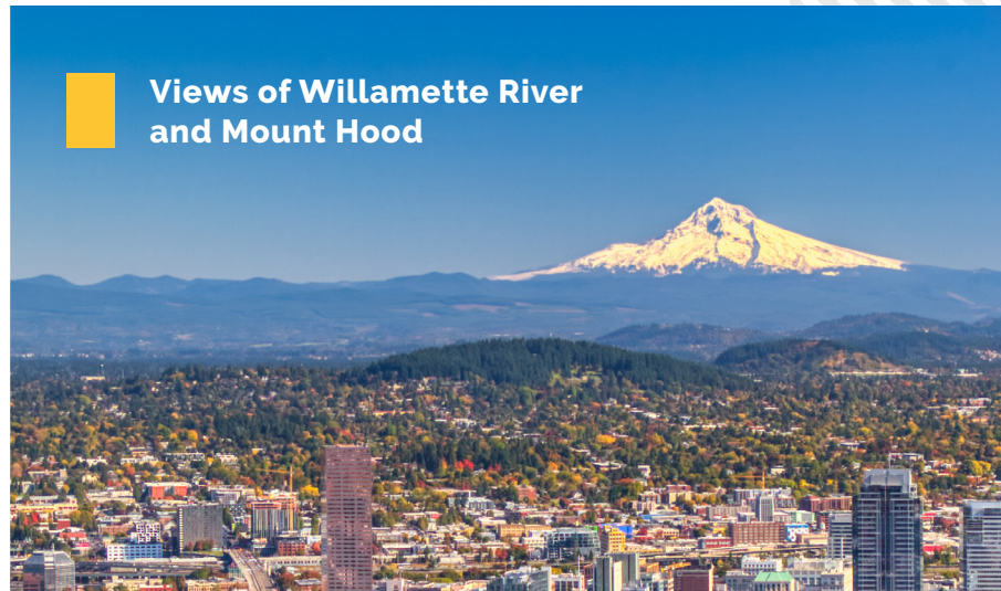
Views of Willamette River and Mount Hood

On-site property management and in-house building engineers