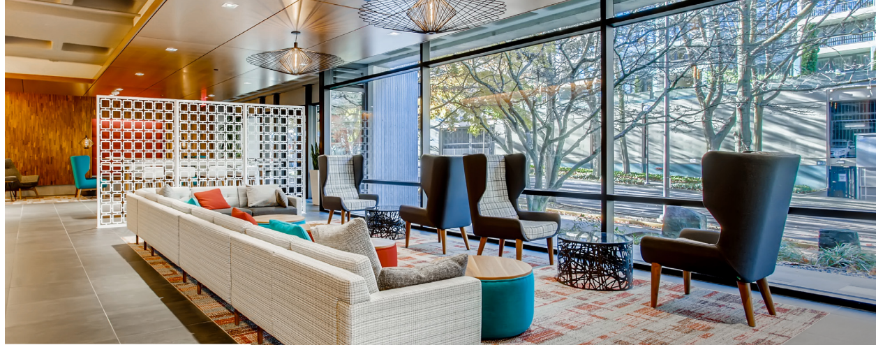
Recent award winning lobby remodel and expansion