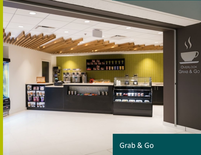
Grab & Go