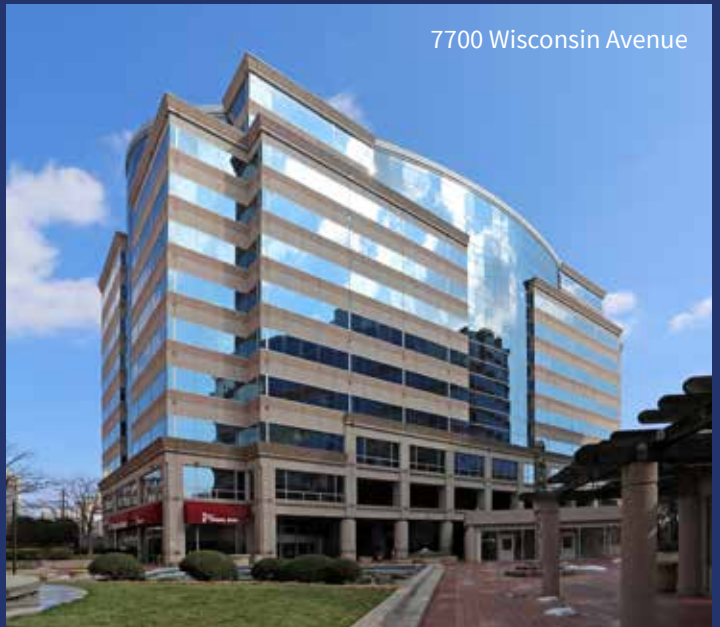
7700 Wisconsin Avenue