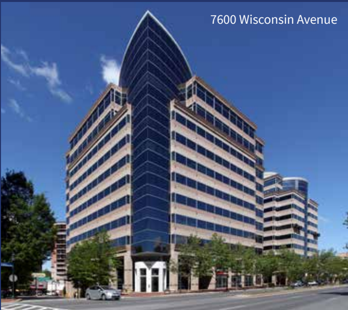
7600 Wisconsin Avenue