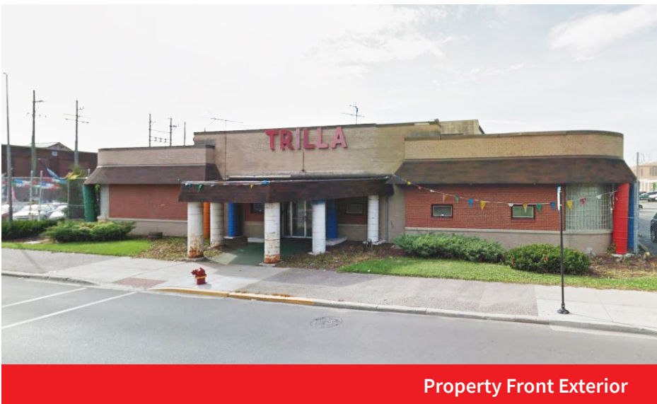
Property Front Exterior