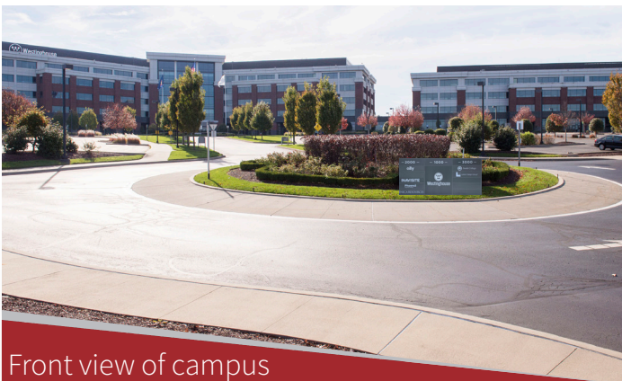
Front view of campus