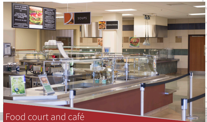
Food court and café