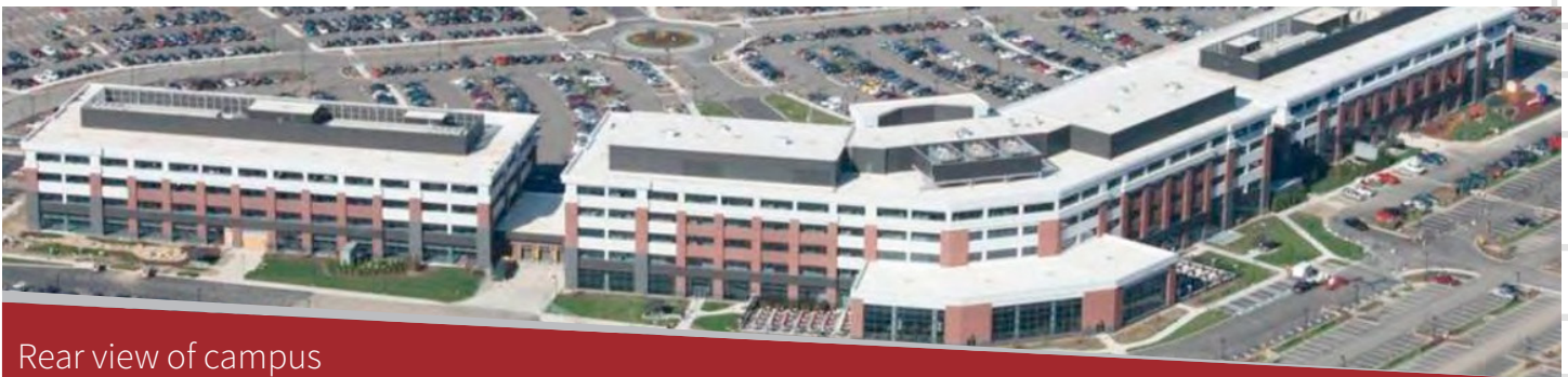
Rear view of campus