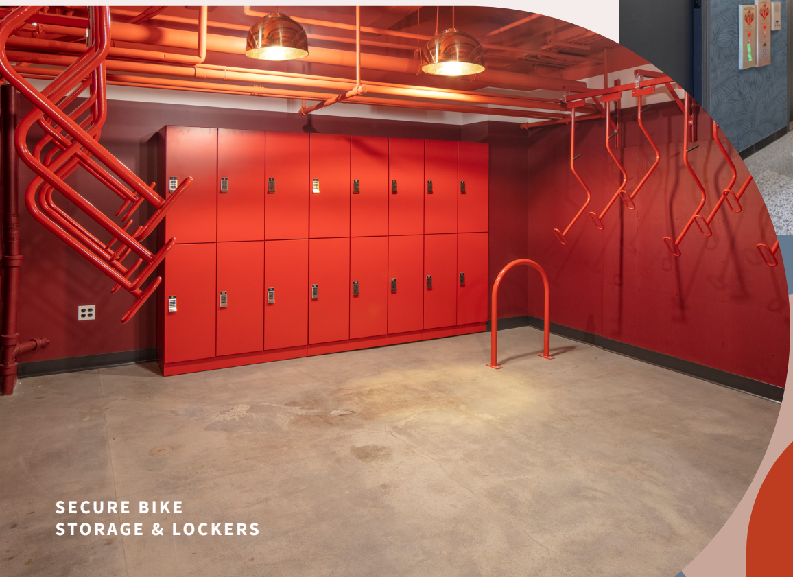
SECURE BIKE STORAGE & LOCKERS

2 NEW INDIVIDUALLY UNIQUE FULL FLOOR SPEC SUITES designed by Ankrom Moision Architects