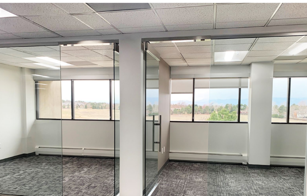
High-end Spec finishes