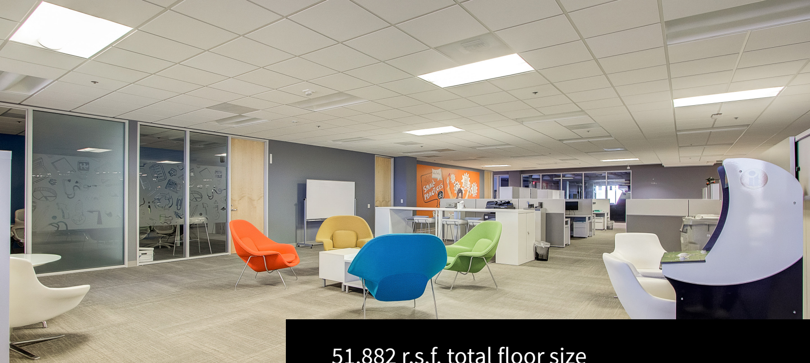
51,882 r.s.f. total floor size