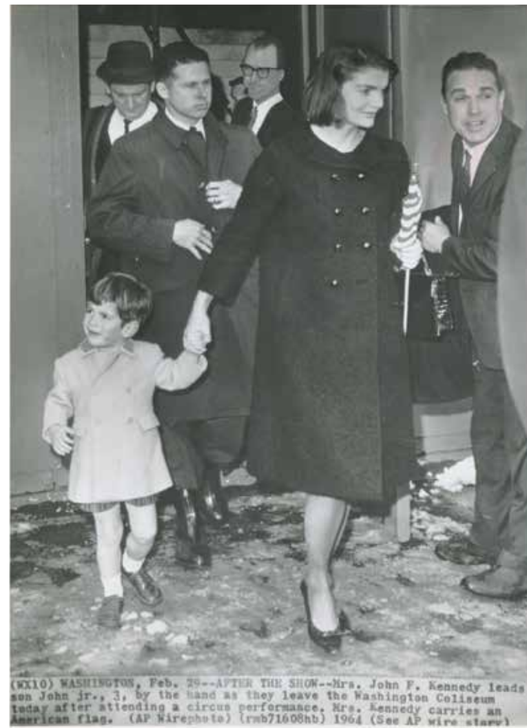
(XK10) WASHINGTON, Feb. 29--AFTER THE SHOW--Mrs. John F. Kennedy leads son John Jr., 3, by the hand as they leave the Washington Coliseum today after attending a circus performance. Mrs. Kennedy carries an American flag. (rwb71608nb) 1964 (See AP wire story)

WASHINGTON LIONS HOCKEY CLUB American League—1948-49 Season