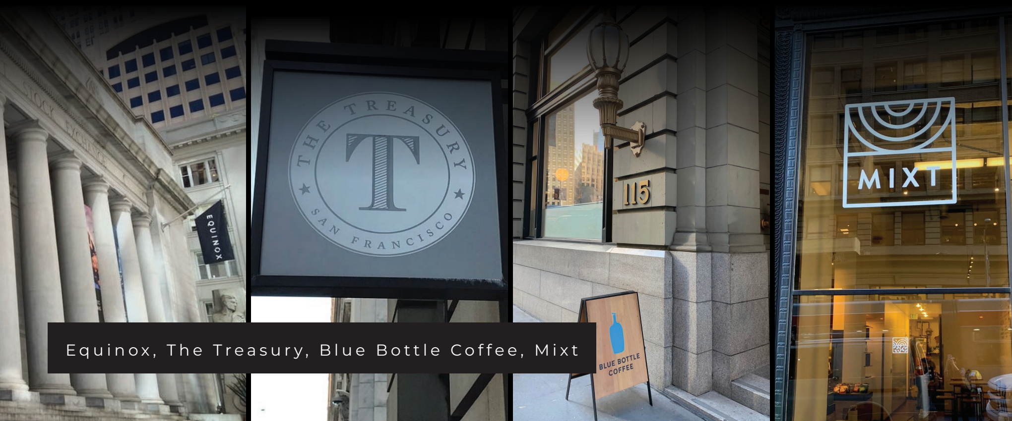
Equinox, The Treasury, Blue Bottle Coffee, Mixt

The North Financial District is home to more than 20 million square feet of Class A office space and the headquarters for numerous Fortune 100 companies including Wells Fargo and McKesson Corporation. Serving this dense daytime population are world class eateries including Leo's Oyster Bar, Michael Mina, Pabu, The Treasury and Wayfare Tavern. Served by the highest trafficked public transportation stations in the Bay Area Rapid Transportation (BART) system, Embarcadero and Montgomery, over 90,000 daytime employees access the sub market only several blocks away.