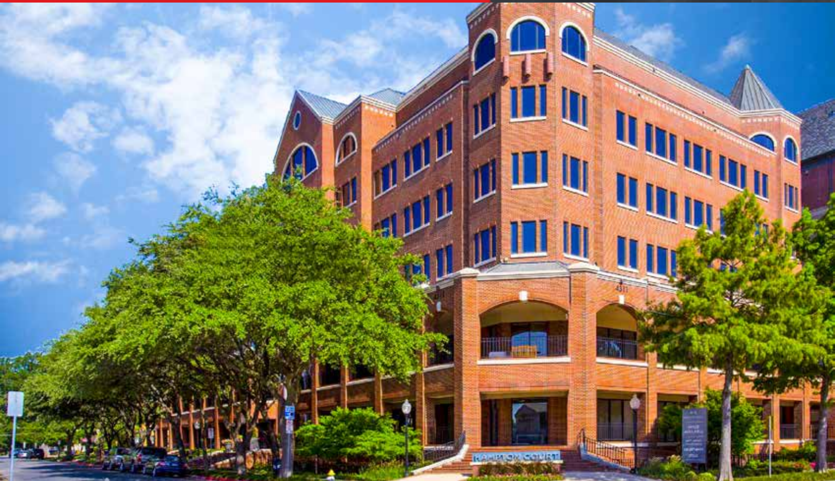
4311 OAK LAWN AVE. | DALLAS, TEXAS 75219