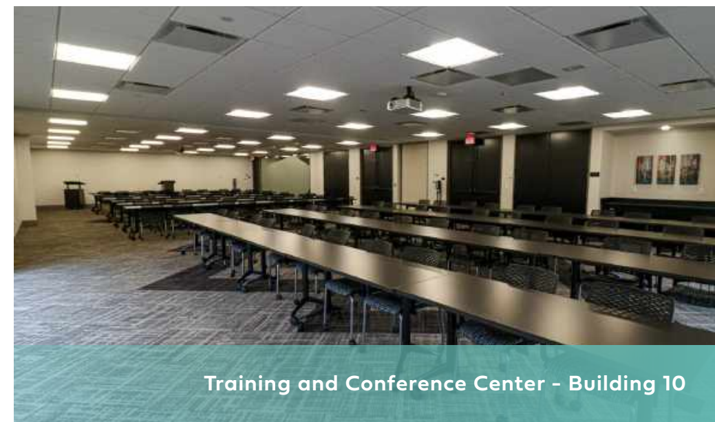
Training and Conference Center - Building 10