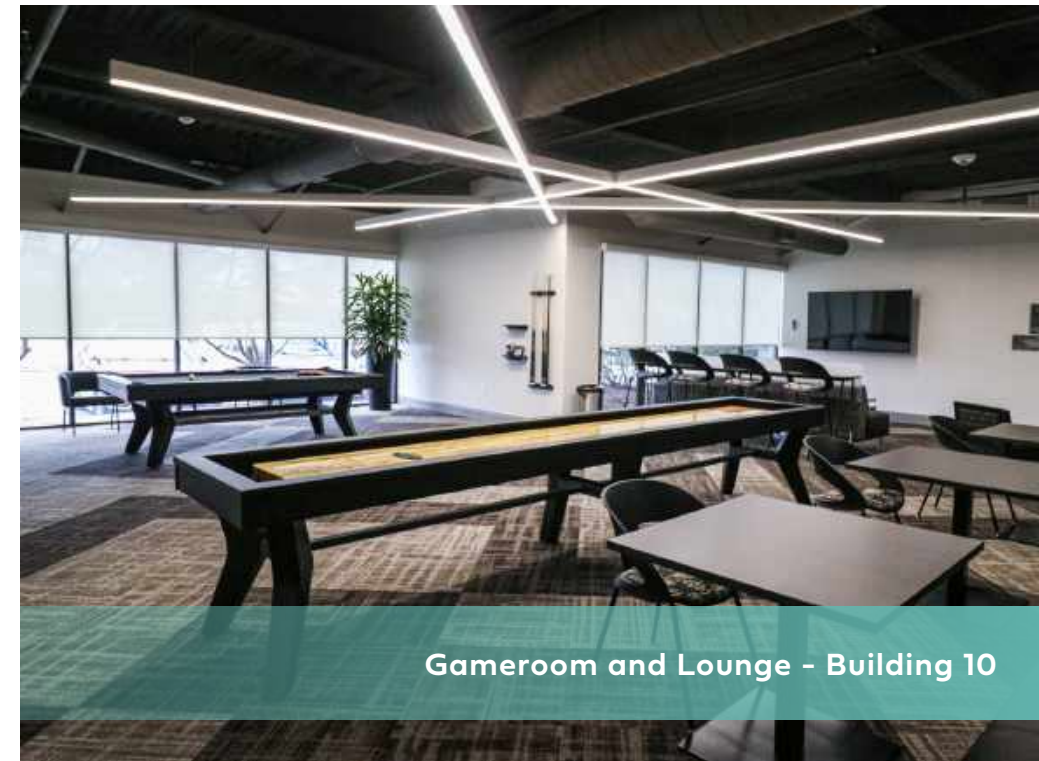
Gameroom and Lounge - Building 10