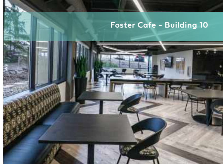
Foster Cafe - Building 10