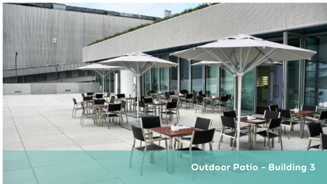
Outdoor Patio - Building 3