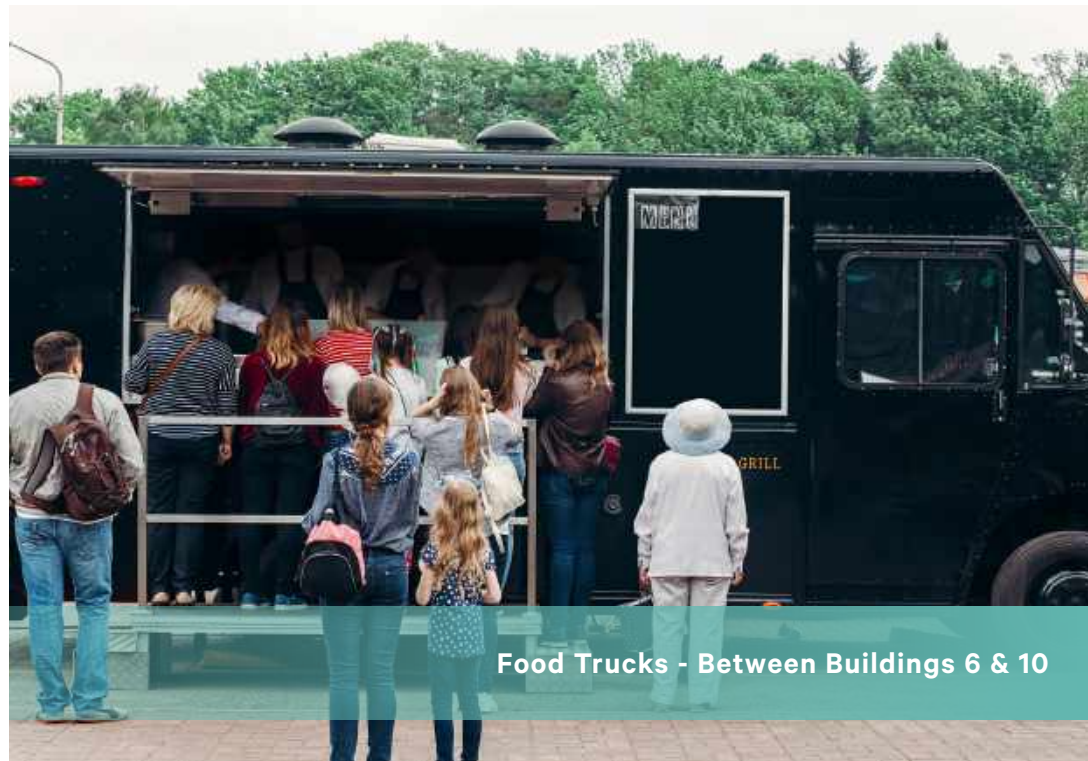
Food Trucks - Between Buildings 6 & 10