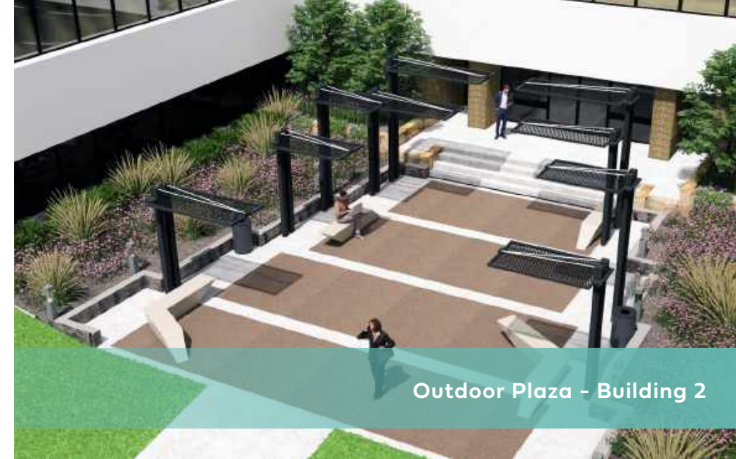
Outdoor Plaza - Building 2