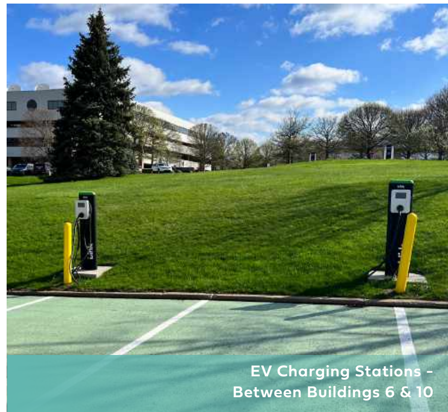
EV Charging Stations - Between Buildings 6 & 10