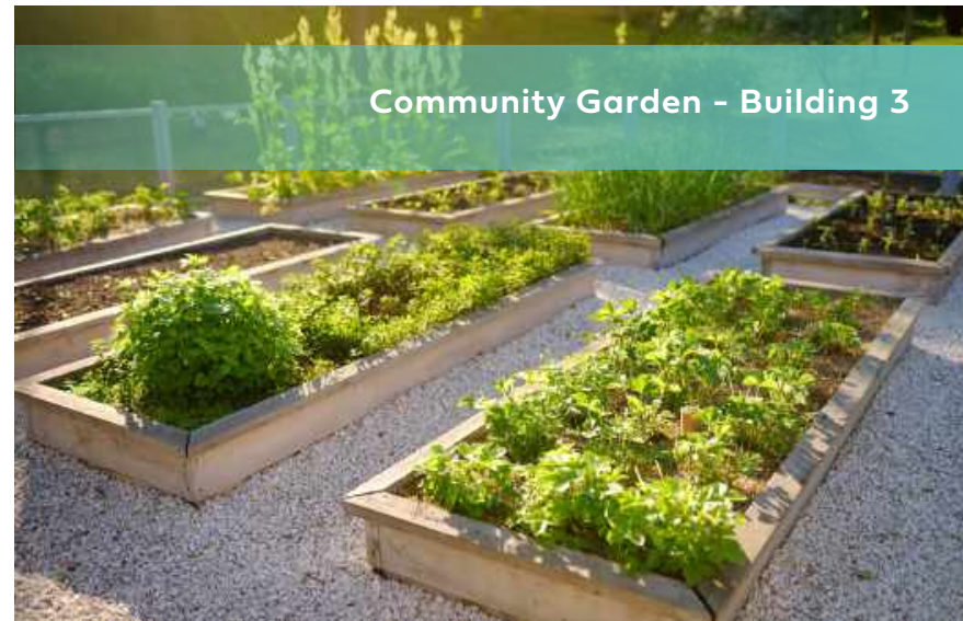
Community Garden - Building 3