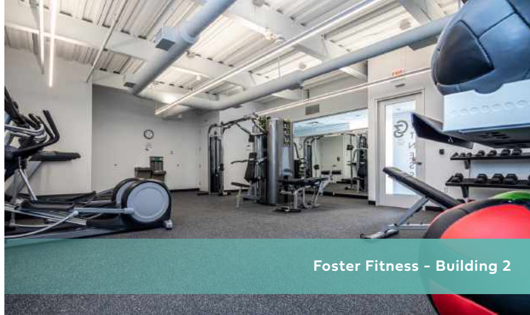
Foster Fitness - Building 2