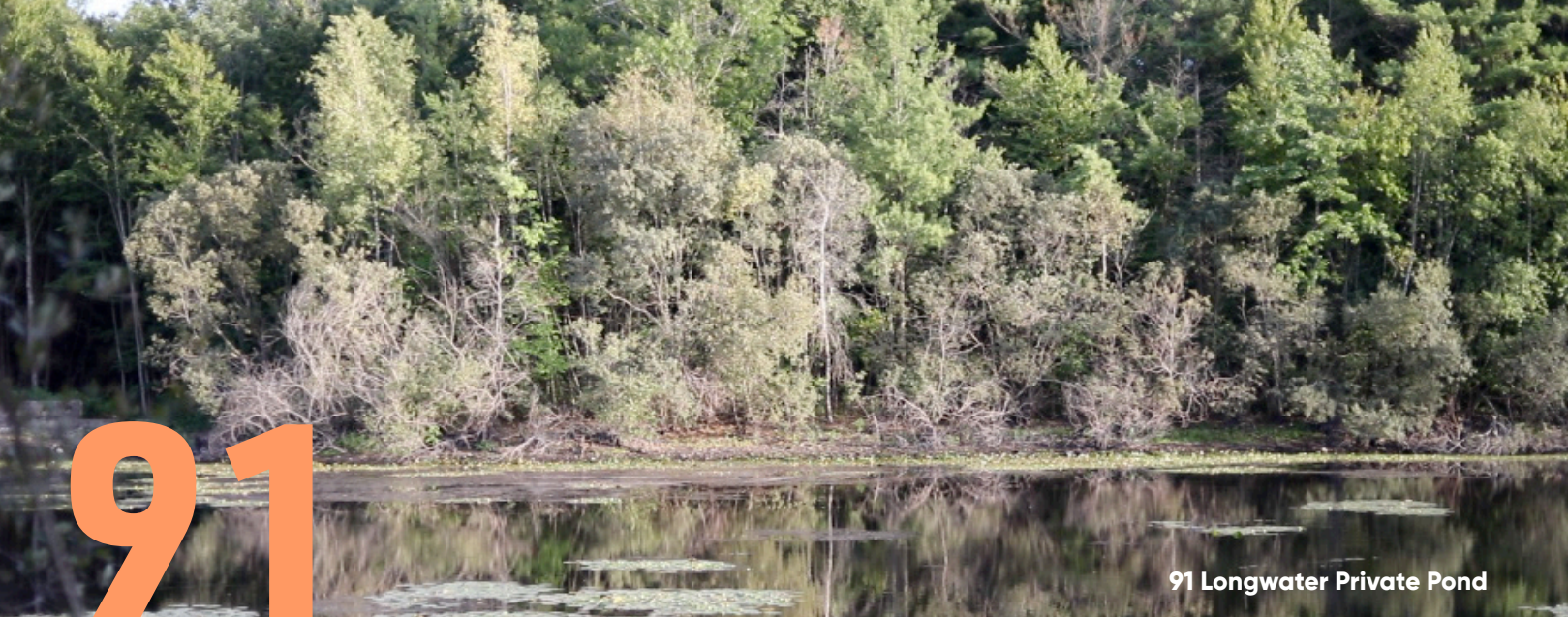
91 Longwater Private Pond