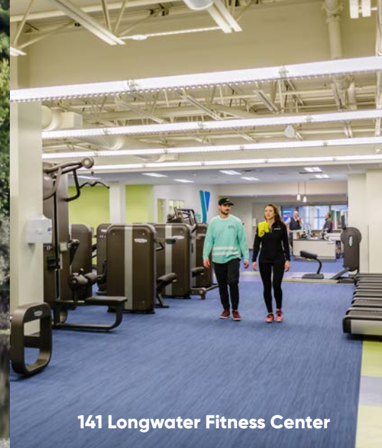
141 Longwater Fitness Center