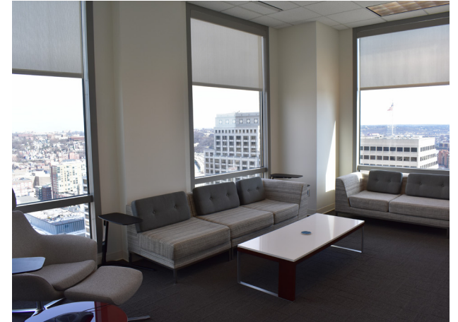
Huddle room with ability for versatile use.