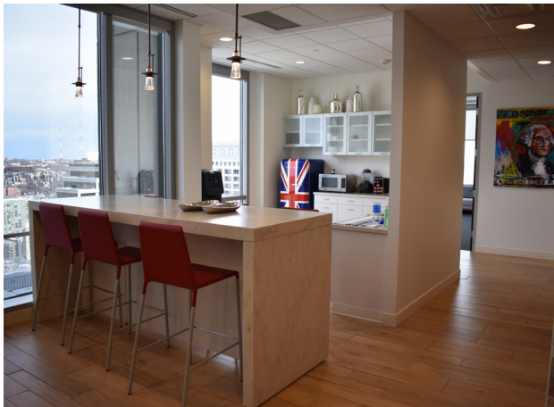
Break room with a bar, dishwasher and plenty of room for storage.