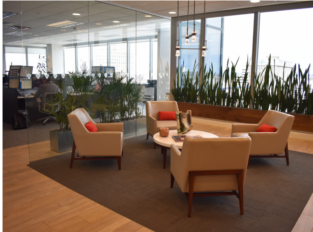
Lounge area in the center of the space.