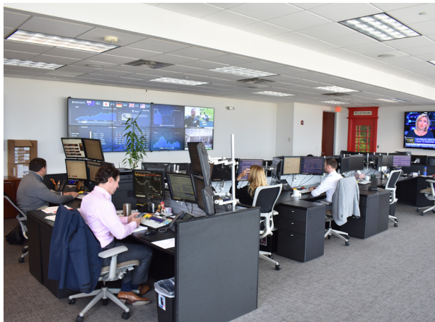
Open floorplan for workstations.