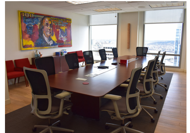
Large conference room with 12-person seating.