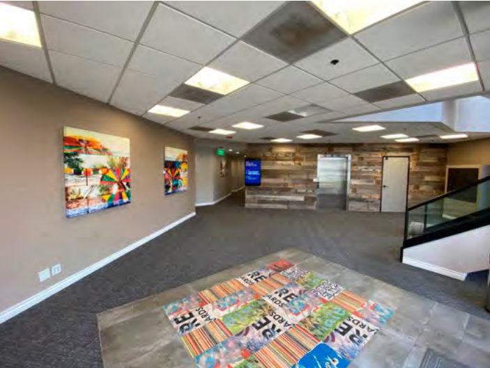
Upgraded common areas