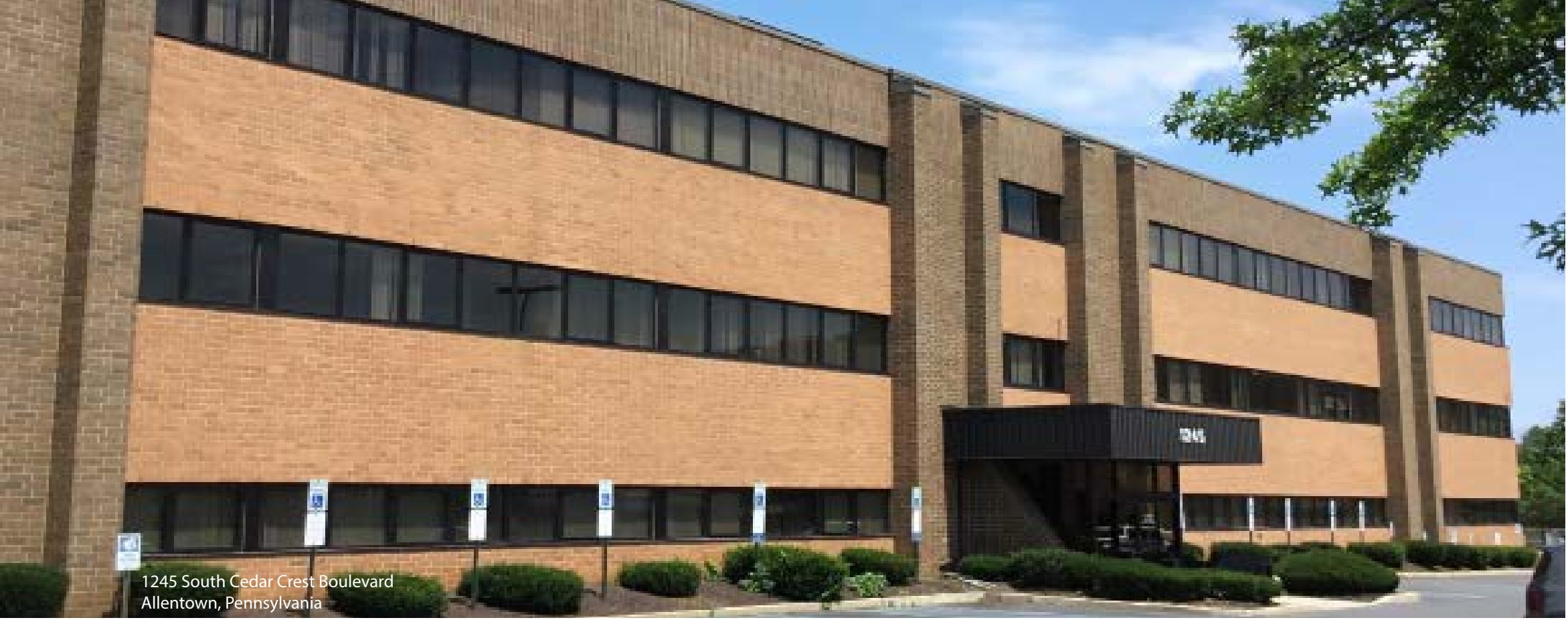
1245 South Cedar Crest Boulevard Allentown, Pennsylvania

Conveniently located off Interstate 78, Cedar Crest Professional Park offers flexible floorplates for a variety of users, with availability sizes from 700 to 30,000 SF. Numerous nearby amenities surround the business park, including Allentown's top shopping, retail, lodging, and entertainment hot spots. On-site amenities include a state-of-the-art fitness center and two restaurants.