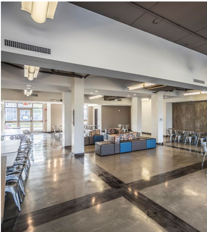
Prepared kitchen area