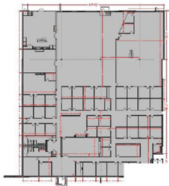
OPTION A (AS BUILT)

See below floorplans for existing layout as well as conversion to more warehouse/storage