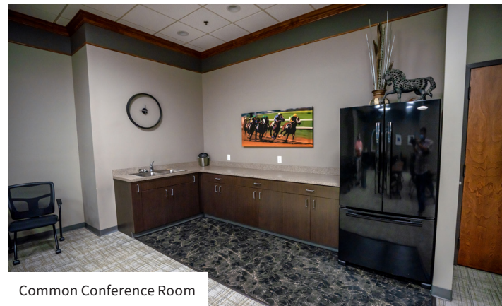
Common Conference Room