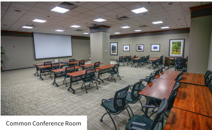
Common Conference Room