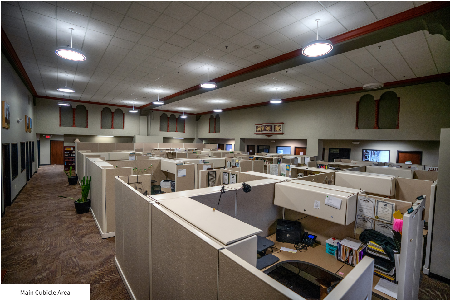
Main Cubicle Area