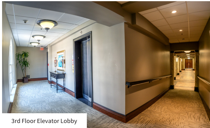
3rd Floor Elevator Lobby