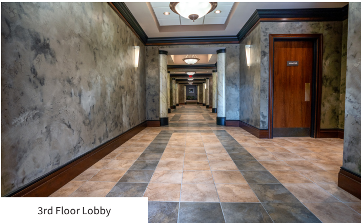
3rd Floor Lobby