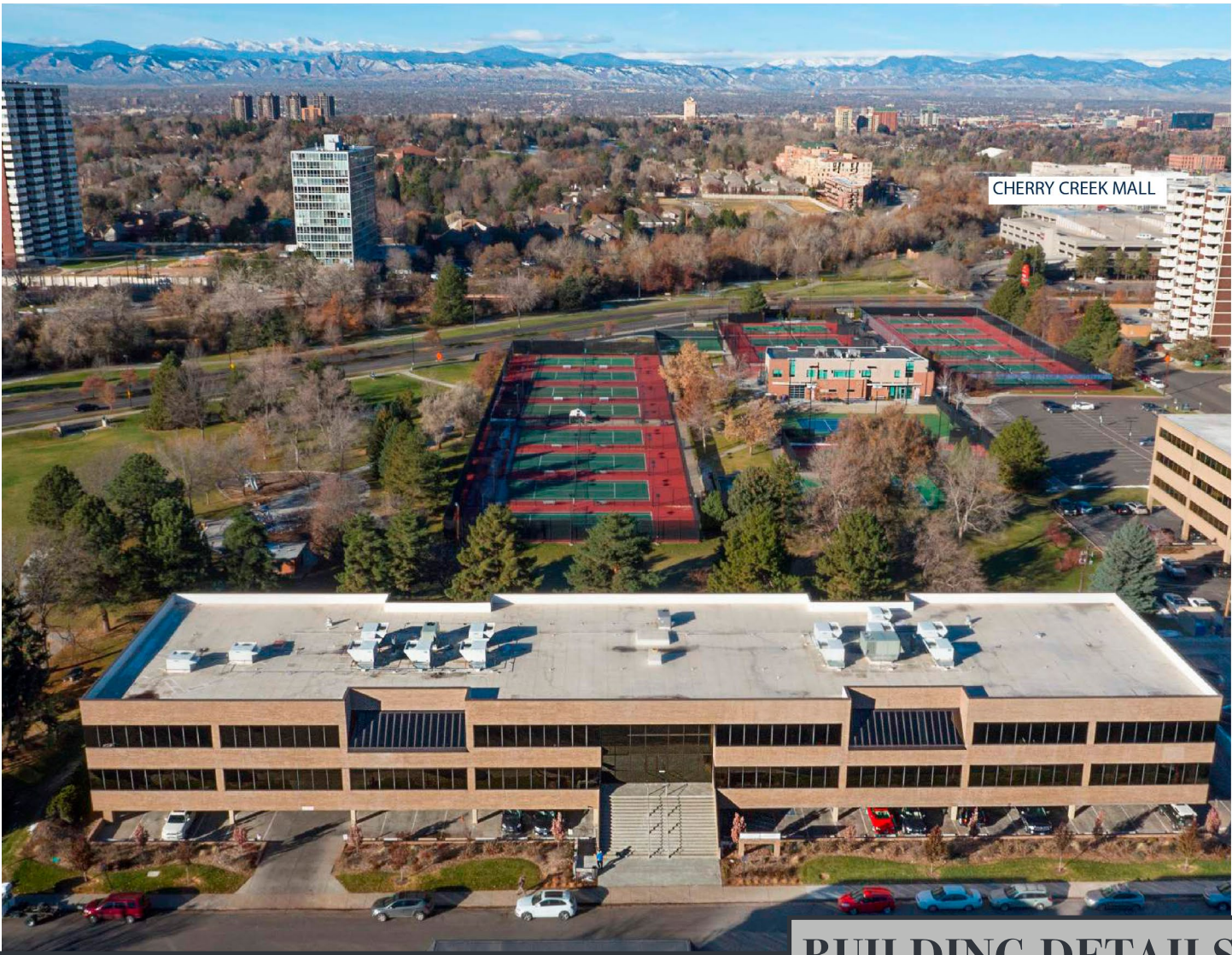
CHERRY CREEK MALL