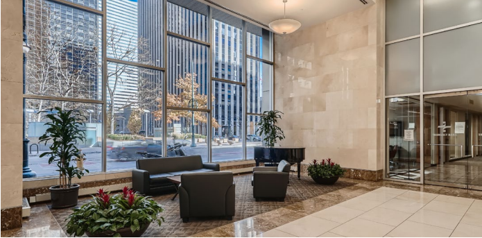
Class A Lobby