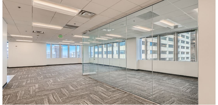
Move-in ready spec suites