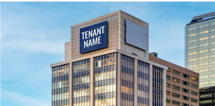
Building top signage