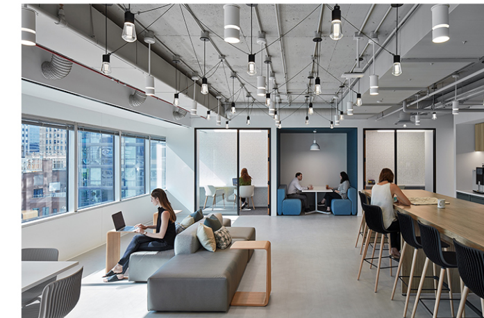
HUBS @ CAFE