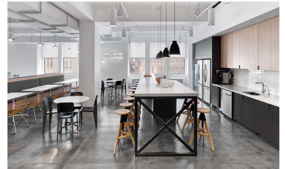
CAFE ONE + TWO