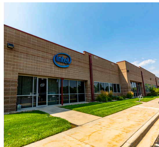
1921 CORPORATE CENTER CIRCLE