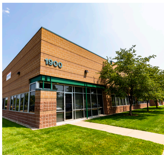
1900 SOUTH SUNSET STREET