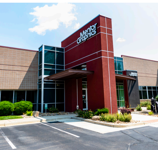
1811 PIKE ROAD

Longmont Power and Communications electric rate are 30% less expensive than the surrounding power providers