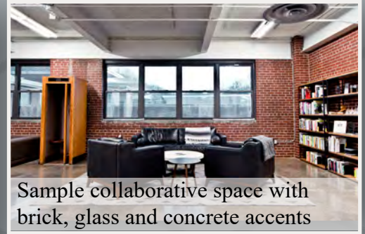
Sample collaborative space with brick, glass and concrete accents