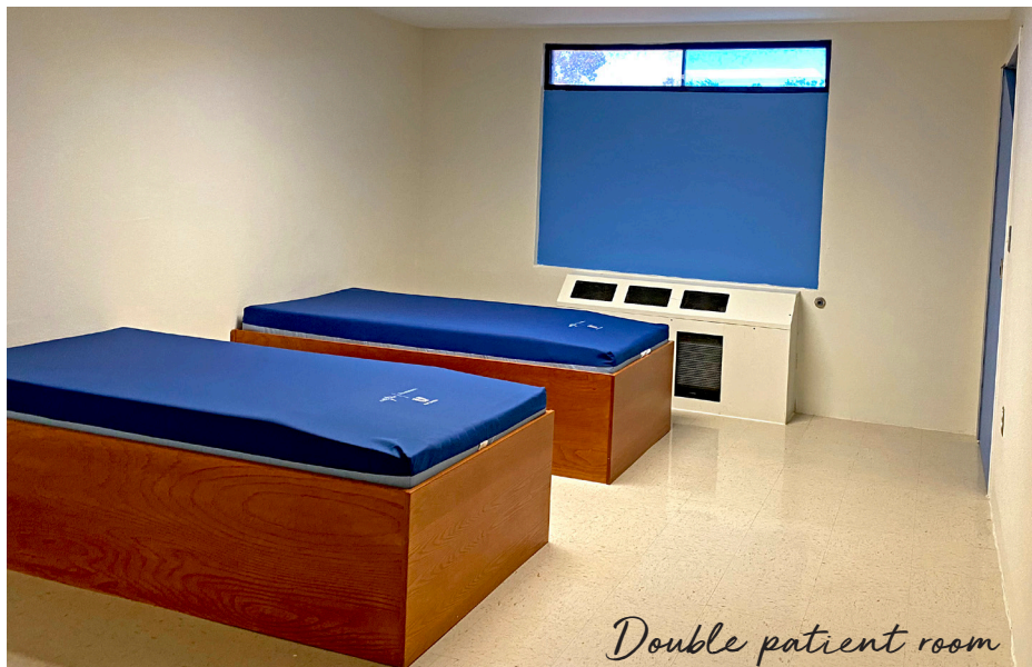
Double patient room