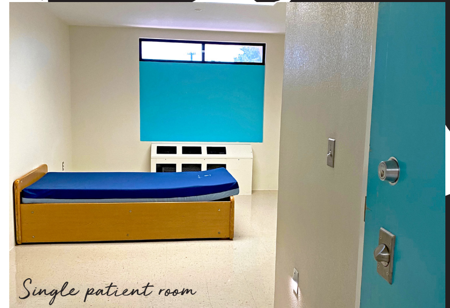
Single patient room