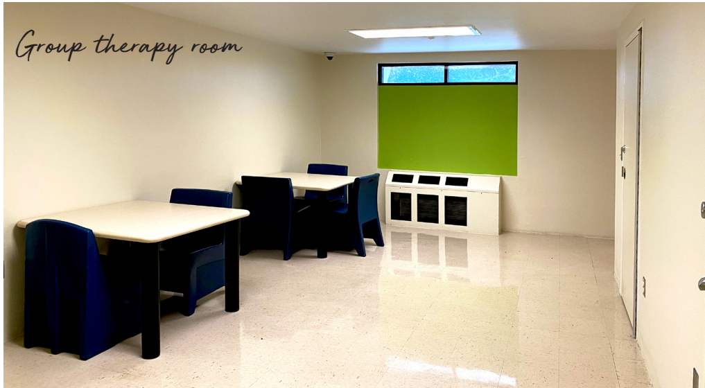
Group therapy room