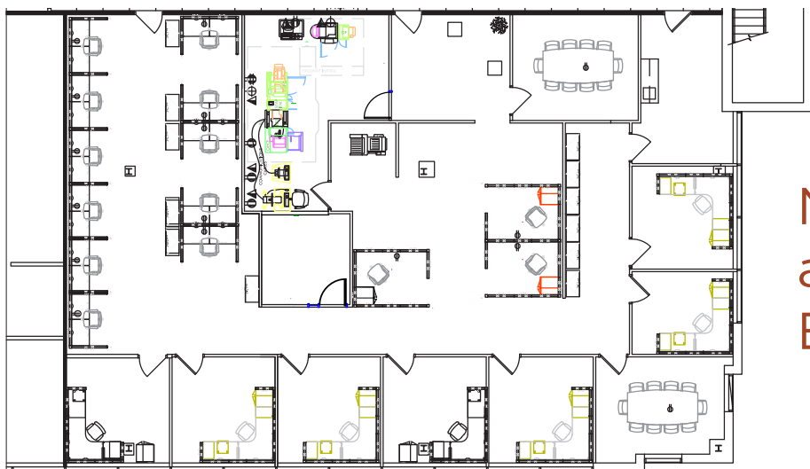
1st floor | 4,508 RSF

NEW AVAILABILITIES at Penn Center West Building One!