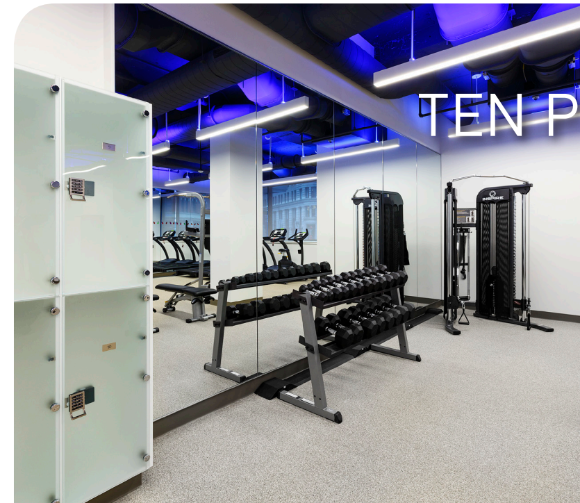
GYM, SHOWERS & BIKE STORAGE

● BEAUTIFUL VIEWS overlooking Norman B. Leventhal Park