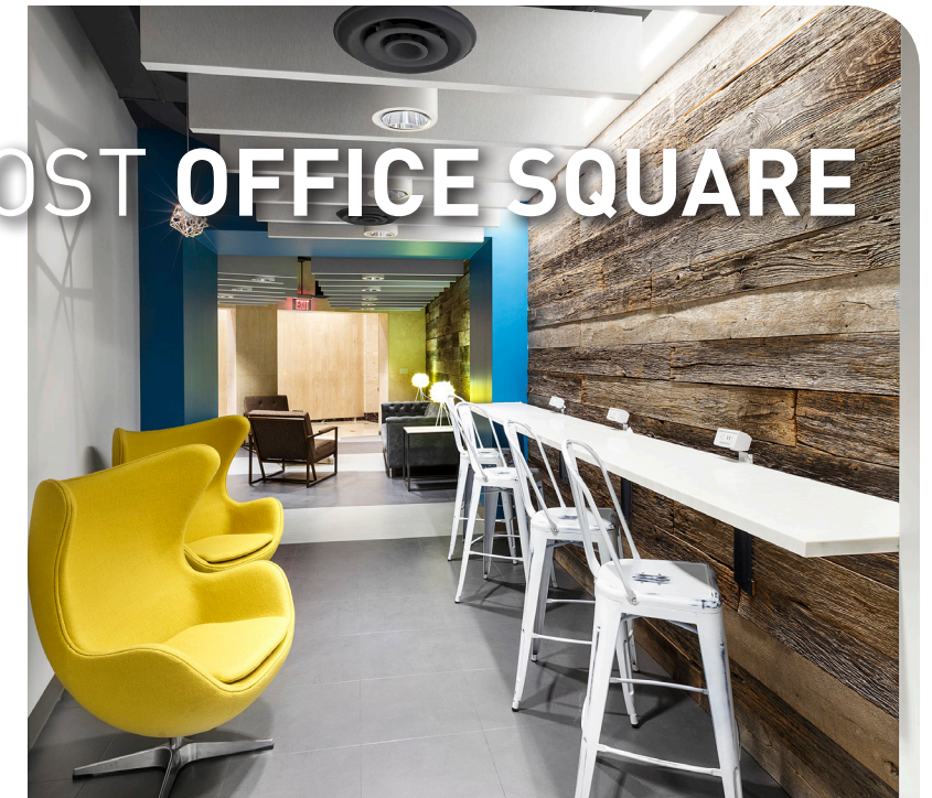
WIFI LOUNGE & CONFERENCE CENTER