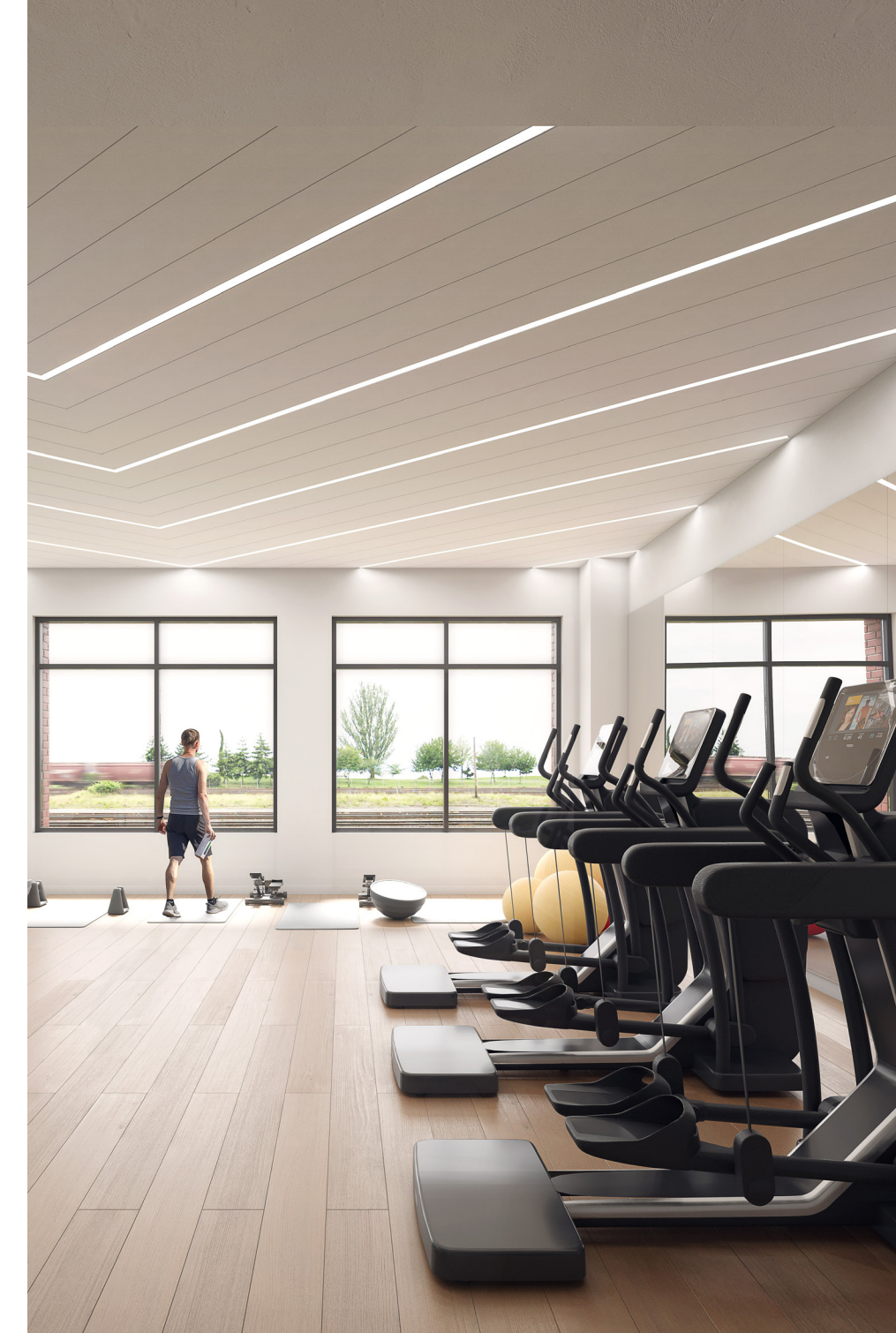
..... UPGRADED FITNESS CENTER, LOCKERS AND SHOWERS .....