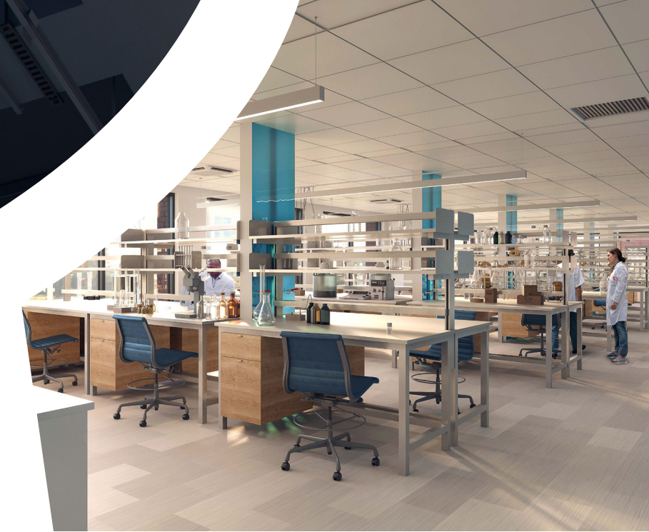
OUTFITTED LAB SPEC SUITE