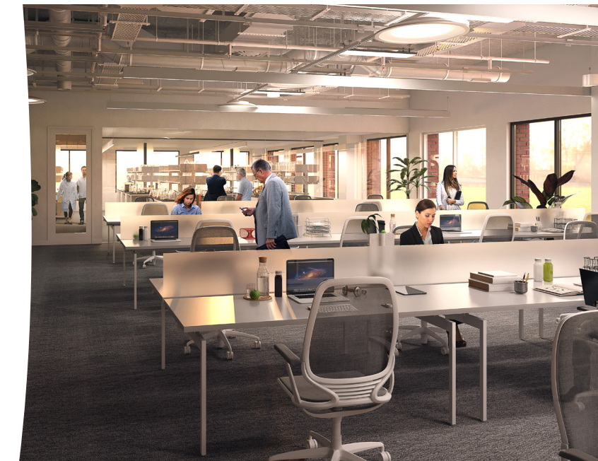
FLEXIBLE OFFICE-TO-LAB SPEC SUITE