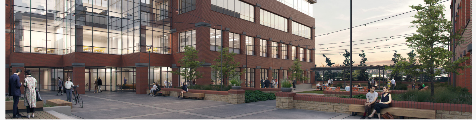
WEST COURTYARD VIEW OF ELLIOTT BAY