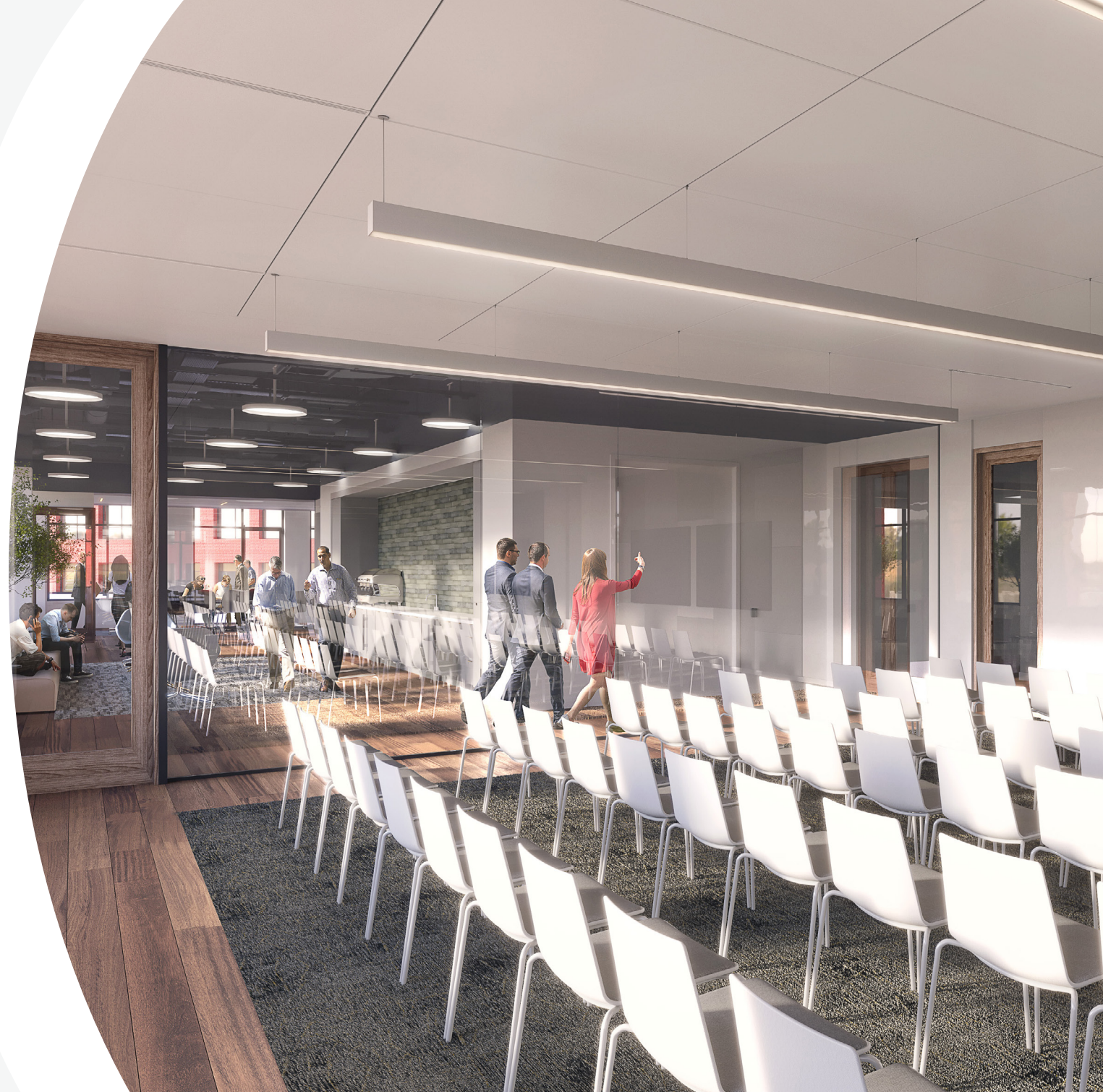
..... FULLY RENOVATED CONFERENCE FACILITY .....