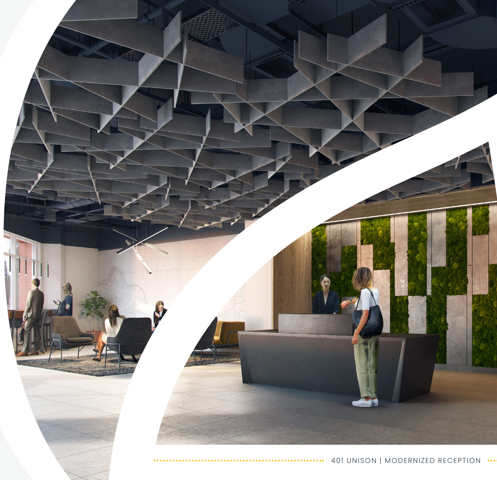
401 UNISON | MODERNIZED RECEPTION