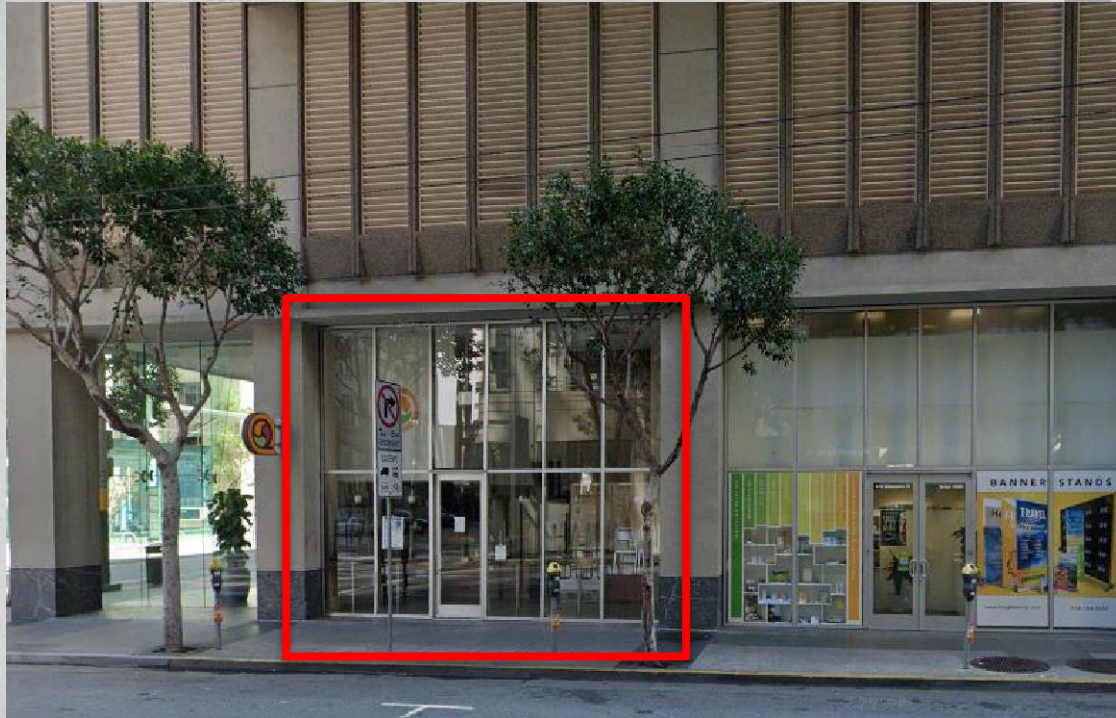
STORE FRONT FACING CLAY STREET