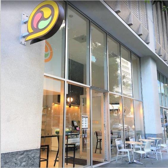
STORE FRONT FACING CLAY STREET