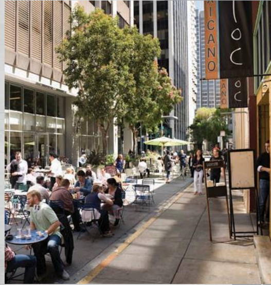
LUNCH TIME AT MIXT GREENS