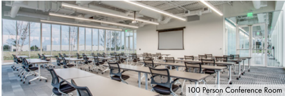
100 Person Conference Room