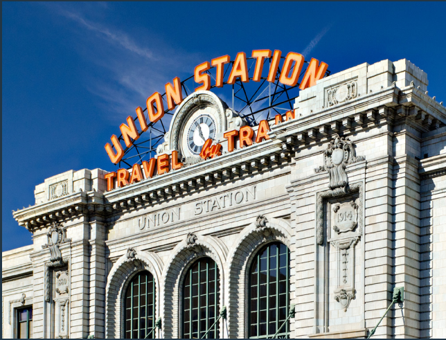
VIEW FROM THE FRONT DOOR