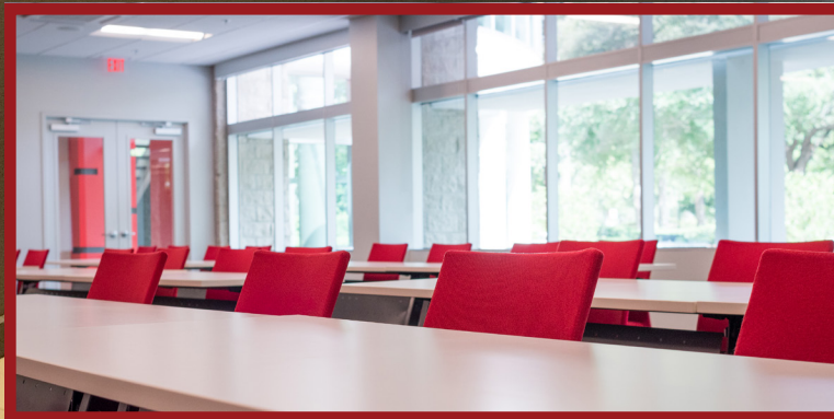
On-site conference center