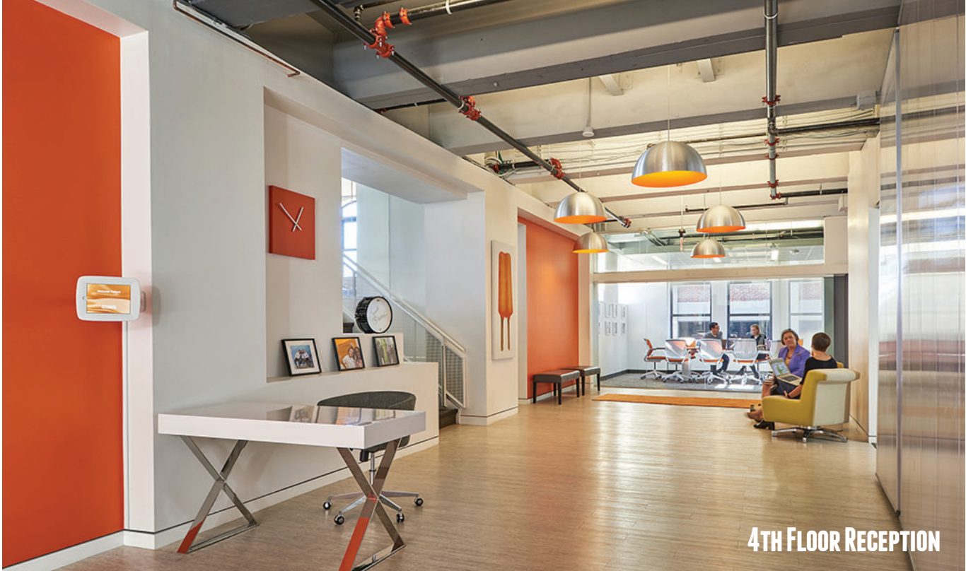
4TH FLOOR RECEPTION