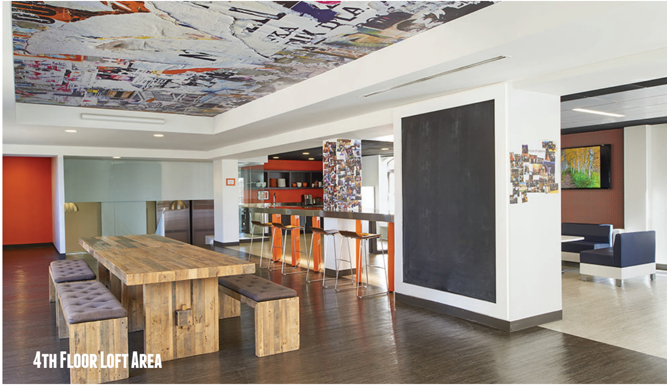
4TH FLOOR LOFT AREA