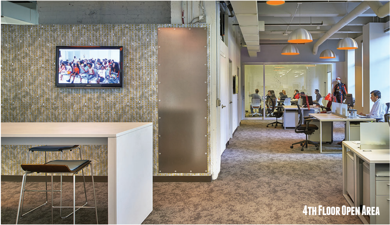
4TH FLOOR OPEN AREA