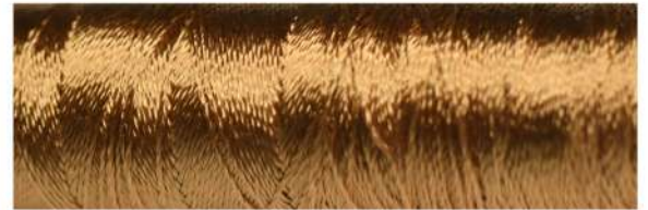
Madeira Rayon №40 col. 1126

Completing the centre, switch to the final - the bottom part of the "hill". Use a new shade of rayon embroidery thread and, spreading the stitches the same way, cover the spare part of the land. Mind the border, it should be fine and smooth.