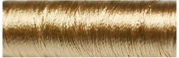
Madeira Rayon №40 col. 1055

Using a new shade of embroidery thread, stitch the central part of the hill. Spread the stitches the same way as you have recently done (radiantly). Vary a short and a long stitch.