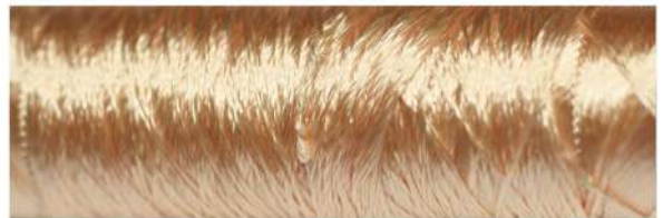
Madeira Rayon №40 col. 1084

A new strand - is a new land. Thread the needle with a new thread and start spreading the stitches.